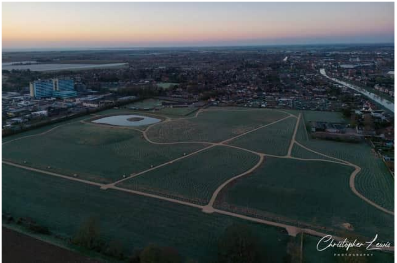
aerial photo of Dion's Wood, situated near to Boston's Pilgrim Hospital.

They also aim to "prioritise the wildlife", so no dogs will be allowed and visitors will be asked to keep to the paths.